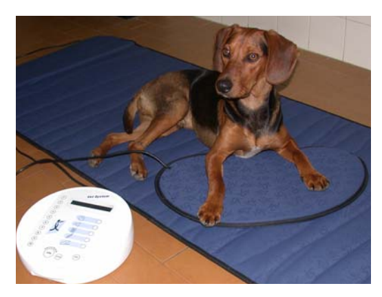
Fig. I: A patient lying on a pulsed electromagnetic field mat.

therapy. Interval data were given as mean \pm SD. The data recorded 0-10 were re-elaborated and scored in a 0-4 scale. For determining the variation before, during and after treatment for all groups, the paired t tests were used. To compare the difference between groups at each point time, the Student's t -Test was applied.